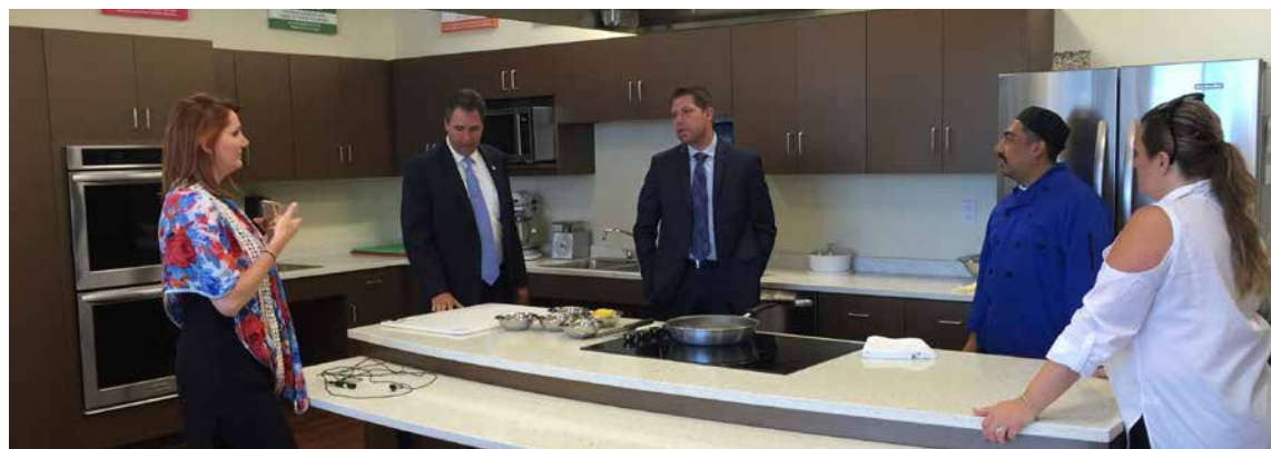
Production meeting at Raritan Bay's Studio Kitchen

A new cooking show, Healthy Kitchen will be coming to your television sets on OBTv.